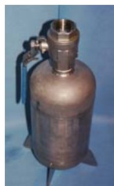
Reaction vessels Parr bombs