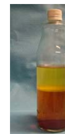
Two Layered Liquids