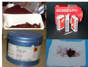
Red Phosphorus Flammable