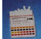
pH test strips