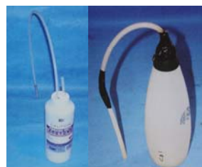
HCL Generators Corrosive Acid