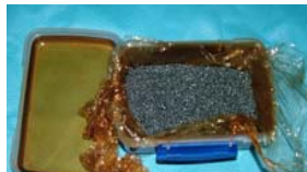
Iodine – Irritant