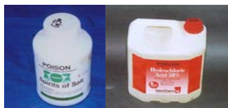
Hydrochloric Acid Corrosive Acid